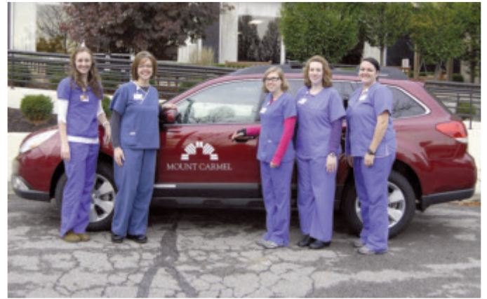
Mount Carmel rehabilitation staff members alongside “Ruby Sue”.