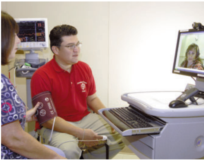
Onscreen language interpreter facilitating understanding of medical treatment.

They say communication is the key to any relationship. That's doubly true when the relationship is between a medical professional and a patient. Understanding a patient's concerns and accurately diagnosing and treating his or her condition are completely dependent upon clear communication. And when those two parties don't speak the same language, it's a considerable challenge.