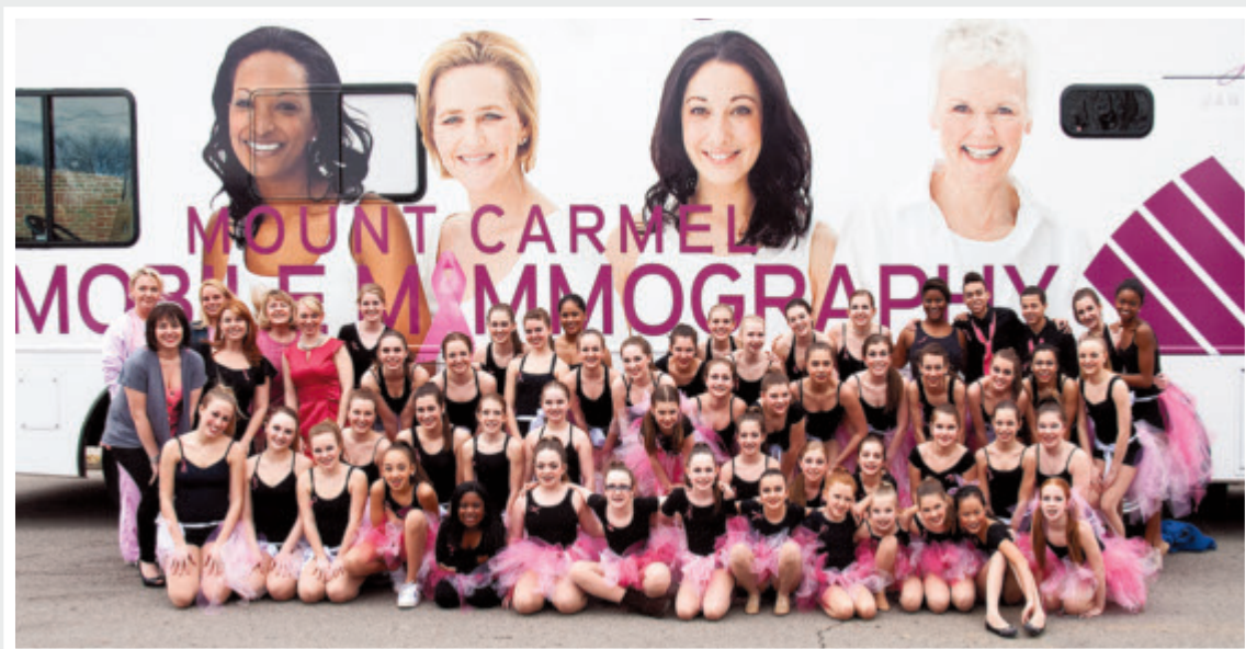
Judy Dollenmayer Studio of Dance's Elite Company

Through ticket sales and local sponsorships, the event raised more than $10,000 – all of which was donated to the Mount Carmel Foundation's Women's Health Fund, which provides free programs and support for breast cancer patients and mammograms for underserved women throughout central Ohio.